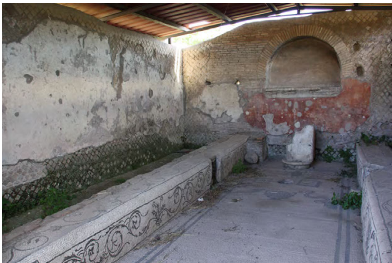
Figure 5. Mitreo delle Sette Porte.

Some altars in the Ostian Mithraea had a hole, probably for a lamp. The front of the altar may have been pierced, so that light could shine through it and create a crescent or illuminate a relief on the front part of the altar. The statue of the sun god was dramatically lit in this way in the so-called Mithraeum of the painted walls ( Mitreo delle pareti dipinte ). The cult's central myth was represented behind the altar, usually in a wall relief. The iconography in different sanctuaries varies only slightly, but the materials used in cult images and the quality of the execution differs. Mithras, wearing a Persian outfit, is depicted slaying the bull with a knife. A dog leaps towards the blood spurting from the wound, while a snake reaches for it from the other side and a scorpion attacks the genitals of the bull. A raven above watches the scene. Two torch-bearing youths, Cautes and Cautopates, are depicted as statuettes or in mosaics at the entrance of the sanctuary or on either side of the altar. 27