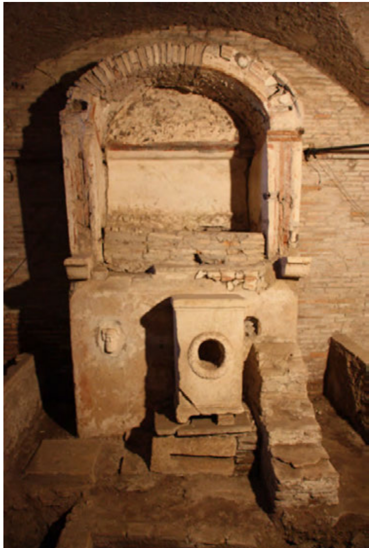
Figure 3. Mitreo del Caseggiato di Diana.

Mithraea were distributed quite evenly around different parts of Ostia, but are not found in the most central public areas or along the main streets. 15 Some of the oldest Mithraea in Ostia were installed in residential buildings, insula or domus , in which one or two rooms were set aside for use by cult members. At least three Ostian Mithraea are located near baths and four in warehouses. 16 One Mithraeum was built into the foundations of an unfinished sanctuary of an Ostian collegium , probably that of the ropemakers ( Stuppatores ). 17 The construction of the Mithraeum was sponsored by a man named Fructosus, who was also patronus of an association in Ostia of whose name only the first letter s survives. However, the name Fructosus also appears in a membership list of the collegium of the Stuppatores , dating to the same period as the Mithraeum, and rooms used for the production of ropes ( stuppa ) have been identified in the vicinity. 18 We do not know why the original sanctuary of the association was left unfinished. It would have been most unusual to choose Mithras as a tutelary deity of a collegium . It is possible that some members of the Mithraic cult group also belonged to the association of the ropemakers or that the worshippers of Mithras had some kind of contract to use the sanctuary on the premises of the collegium . 19 One additional Mithraeum was identified in the excavations carried out in 2014, called the Mitreo dei marmi colorati , located near a guest