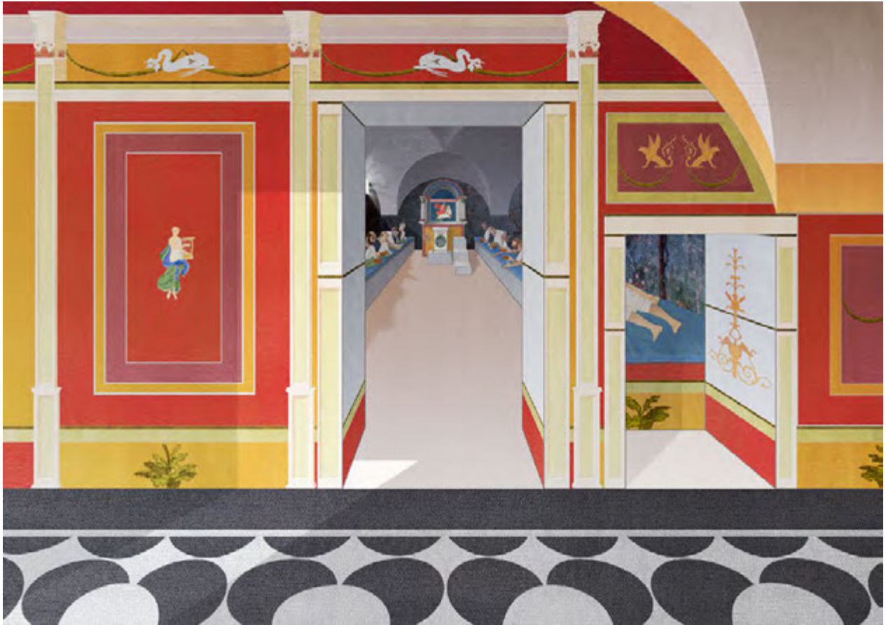
Figure 4. Reconstruction of the Mitreo del Caseggiato di Diana. Reconstruction: Jesper Blid.

house and tavern. This sanctuary has been dated to the second half of the fourth century and is thus the latest known Mithraeum in Ostia. 20