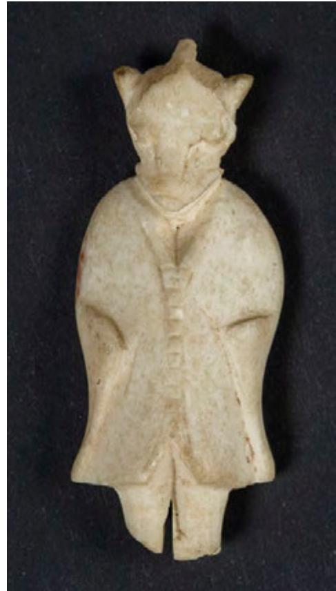
Figure 6 (Cat. no. 157). Handle of a knife, interpreted as an item used in Mithraic rituals. Ostia Nuovi depositi, inv. 4317.

The cult of Mithras was the latest in the line of the great mystery religions and, consequently, the peak in its popularity is also later than that of the cults of Magna Mater, Isis and Serapis. Mithras was still worshipped as Rome was Christianized during the fourth century, and one new Mithraeum was even founded in Ostia during this century. Common features have been identified in the cult of Mithras and Christianity, such as the dualism of good and evil, and were already noted by ancient writers. Like Christ, Mithras may have been interpreted as a mediator and saviour figure. It is still difficult to say if Christianity and the cult