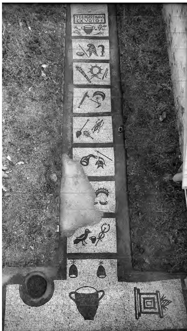
Figure 2. The mosaic of Felicissimus in the Mitreo del Felicissimus.

the central aisle of the so-called Mithraeum of Felicissimus in Ostia 13 there is a black and white mosaic – donated by a man called Felicissimus – whose imagery has had an enormous impact on the definition of the grades of initiation. The lowest grade of was called the raven ( corax ) and was symbolized by a caduceus , the staff of Mercury. The second grade was the bridegroom ( nymphus ), symbolized by a torch, a diadem and an oil lamp. The third grade of initiation was the soldier ( miles ), symbolized by a soldier’s bag, a lance and a helmet. The fourth grade, the lion ( leo ), was symbolized by a spade, a sistrum and a lightning bolt. The fifth