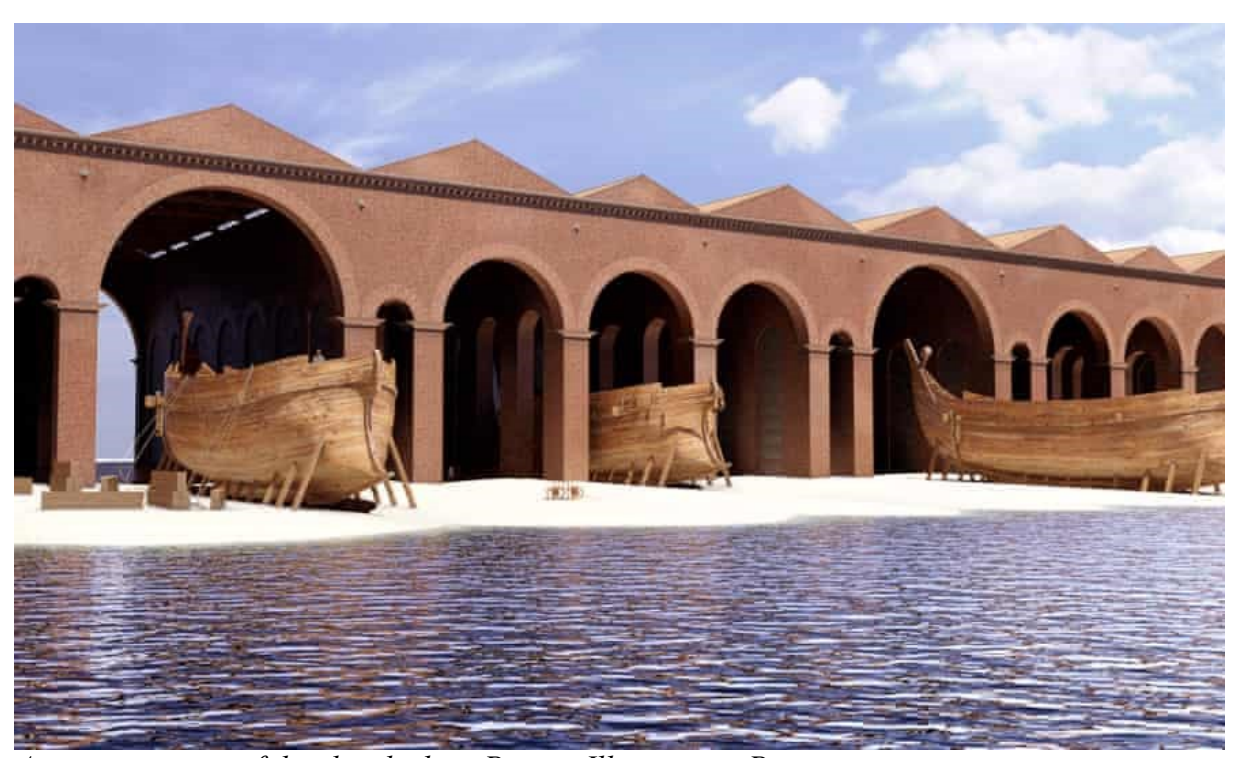
A reconstruction of the shipsheds at Portus. Illustration: Portus project

Recognising the potential of geophysical surveys for examining large sites, Simon co-directed, from 1991 to 1993, a project that mapped the city of Italica, the birthplace of the emperor Trajan, near Seville, revealing a variety of previously unknown buildings. This was later followed with an innovative study using Geographical Information Systems (a computer-based system for analysing maps) to better understand the networking of the dense concentration of Roman urban centres in southern Spain (2000-08).