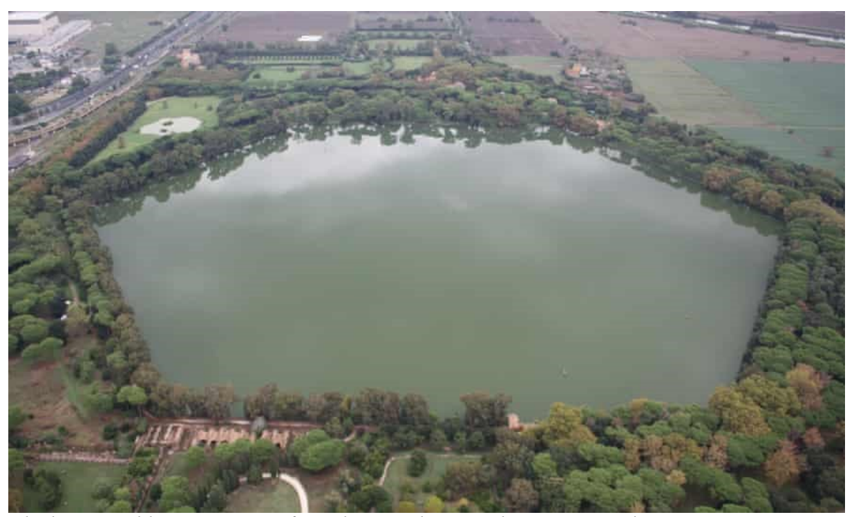
The hexagonal basin at Portus from the air.

The survey revealed the sheer scale of Roman economic activity at the site – warehouses covering more than 145,000 sq metres, a series of 30 metre-wide ship canals, as well as an aqueduct, cemeteries and public buildings. With this knowledge, Simon took on the excavations of the site.